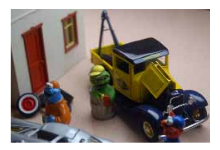
Sesame Street characters made a guest appearance on one retail store entry for October's contest.

Read the Flatwheel online at www.div4.org